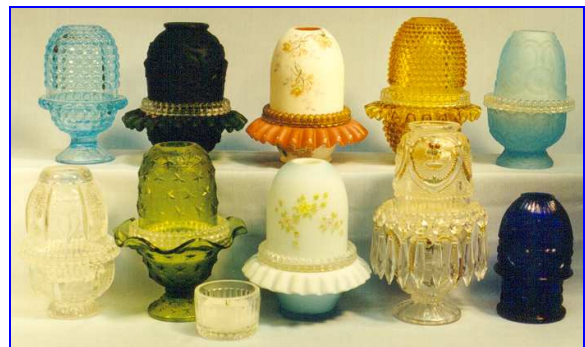
Top: 1000 Eye; Embossed Rose; Peach Blow; Hobnail; Moon & Star; Bottom: Thistle; Stipple Star; Overlay; Sweetheart; Eyewinker

fairy lamps described in the following were identified in a recent issue of ACRN (Ref. 3). They are Castle Reproductions and A.A. Imports as joint purchasers (Castle/AA); Fenton Art Glass Co. (Fenton); Weishar Enterprises (Weishar); Aladdin Mantle Lamp Co. (Aladdin); Mosser Glass Co. (Mosser); and Unknown bidder #136 (Unknown). It must be assumed that the purchasers intend to use these molds.