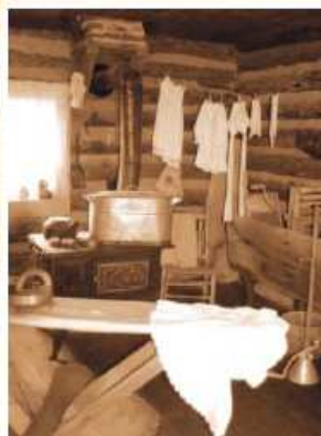
Many of the mid-19th Century hand cut log cabins contain period room settings from the daily life of South Park families. Equipment familiar to every pioneer housewife was used in the care and cleaning of family wardrobes.