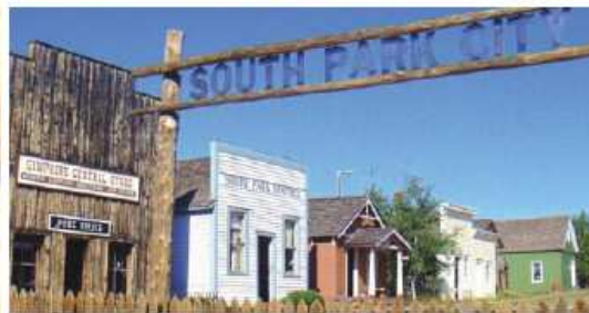
Featured on the west side of the Museum's Main Street is Simpkin's General Store. Included on the premises is a former post office. Beside it is the South Park Sentinel building, featuring a newspaper printing office. Next is the Doctor's Office with an array of 19th Century surgical and medical instruments used by the early day physician. To its right is the house of a Colonel, who was also a buffalo hunter. The green building houses the Barber Shop and the Dentist Office.