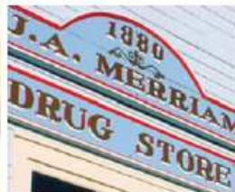
The Drug Store features one of the most complete collections of 1800's remedies and medicines and includes a historic soda fountain. On the right is the bottle rack and pharmaceutical utensils used in the Golden Days.