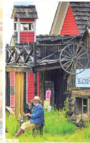
The "Living History Day" is held annually on the 2nd Saturday in August. Volunteers are dressed in period costumes and there are cowboys, gold prospectors, a saloon keeper, dance hall ladies, a doctor, a pharmacist, musicians, a trapper and artists. Goats to pet, a burro and horses are also on the premises. Spend a day of family fun at South Park City and learn about the history and early pioneer time of the 19th Century in the High Country.