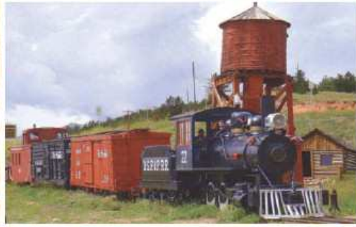
The narrow gauge locomotive was built in 1914 and has a tender, two adjoining box cars and a completely refurbished caboose. Below: Wood and log cabins such as the Blacksmith Shop, the Stage Coach Inn, the Stage Barn, the Star Livery and a ramshackle Homestead. The buildings are filled with authentic period artifacts.